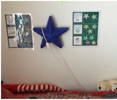
Figure 2: Two A4-sized paper reward charts placed above a child's bed. The child and parents agree on a reward, which the child then draws in the "white boxes". When the child has collected the amount of stars that each reward is worth (two, three, or four stars) the child has earned the reward.

The last activity is a reward that consists of a physical fluorescent star, which the child can place on a laminated A4-sized paper chart as seen on Figure 2 and further described in [23].