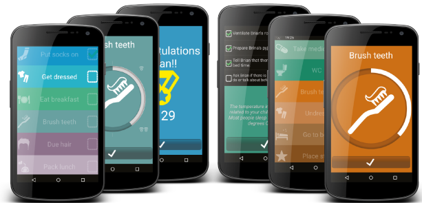
Figure 1: The MOBERO mobile system. Left, the morning module. Right, the bedtime module.

MOBERO (presented in more detail in [23]) is a mobile application that assists parents and children with ADHD to establish healthy morning and bedtime routines, as these situations can often cause frustration [8,19]. We designed and developed MOBERO though an iterative design process involving parents, children with ADHD and ADHD domain professionals as described in [23]. As ADHD is highly heritable [3] and because we learned from our empirical studies that parents' engagement was critical in changing children's morning and bedtime routines, we included routines for parents as well as children in MOBERO [23].