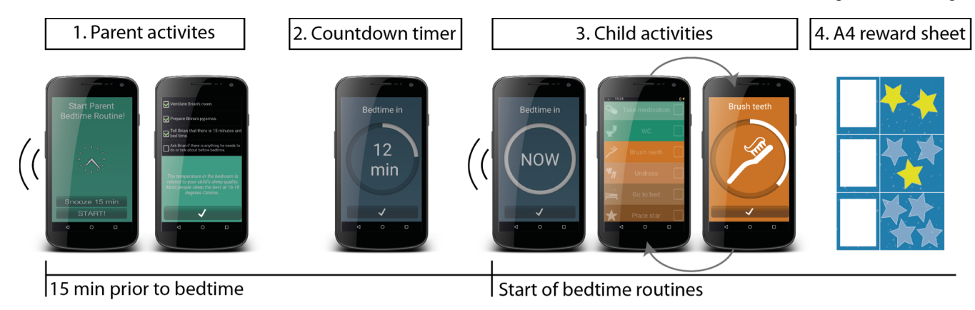
Figure 2. The flow of the MOBERO bedtime module including the child's physical rewards sheet. (The original text was in Danish).

We conducted a four-week study with 11 families and 13 children with ADHD in order to investigate our hypotheses that MOBERO could lower the parents' frustration level during their child's: 1. morning; and 2. bedtime routines; assist the child to become more independent during 3.