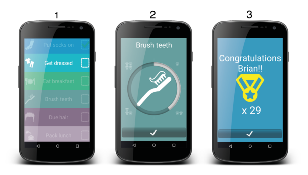
Figure 3. The MOBERO morning module. 1: The list of the morning activities. 2: A specific routine with visualization of time and rewards. 3: The final reward screen.

ADHD-RS is a validated tool used in ADHD diagnosis to measure the severity of symptoms and to evaluate the treatment efficacy in children and adolescents with ADHD [17]. As ADHD in Denmark is diagnosed accordingly to the International Classification of Diseases 10 (ICD-10) as a Hyperkinetic conduct disorder [47], we use the version of the ADHD-RS modified to match the ICD-10 diagnostic criteria. Thus, the version of ADHD-RS used in our study contained a total of 26 questions, with 18 covering the core diagnostic ADHD symptoms of inattention, hyperactivity and impulsivity in addition to eight questions covering symptoms of conduct disorder, which is the most common comorbidity with ADHD. We used ADHD-RS to select